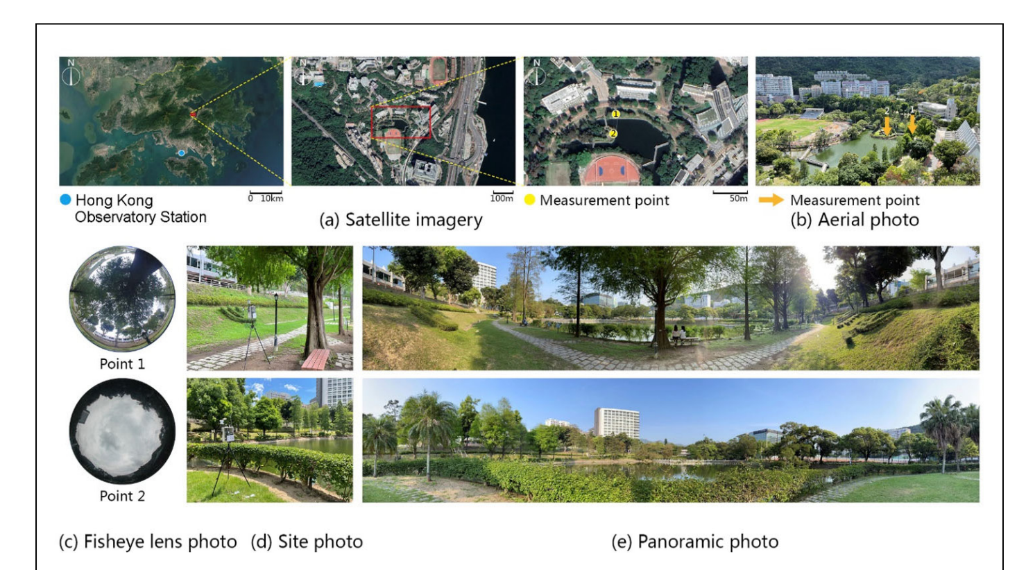
Figure 2. Examples of site aerial photographs and ground images in the guideline.

This proposed guideline significantly contributes to refining systematic field measurement methods at the microscale in urban environments. Researchers are recommended to consult this guideline in planning the collection of urban microclimate field data.