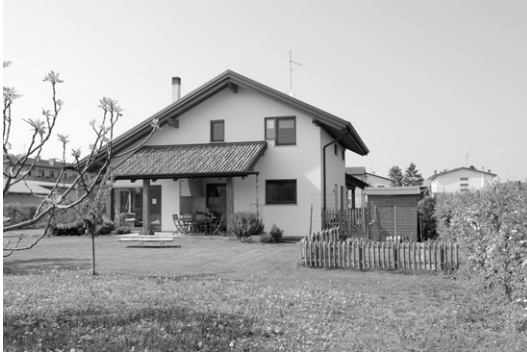
Fig 1. Case study: Villa dei Girasoli

Hereafter a case study is presented where the ITT method is discussed. In particular, a building with a timber post and beam structure and light external walls has been analyzed during winter 2007-'08. It is a single family house called "Villa dei Girasoli" placed in Gonars (Udine - Italy) near the Adriatic Sea, 24 m asl (Fig.1)