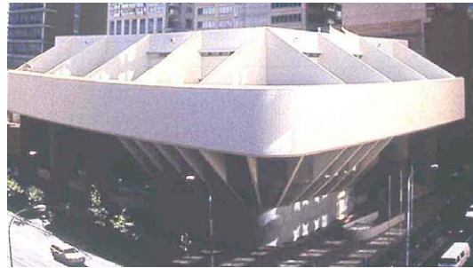
Fig 5. Gilling's Masonic Centre in 1974 [15]

This project demonstrates how the opportunity afforded by the original foundations enabled the developer, Grocon, to create 23000m 2 of grade A office space in the heart of Sydney with a minimum of demolition. Indeed, the existing Masonic Centre remained occupied throughout the tower construction.