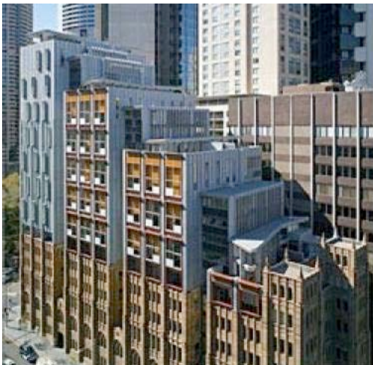
Fig 4. Tim Greer's Adaptation of Scots Church in 2006 [14]

architectural competition for the completion of the building. Tonkin Zulaikha Greer's winning entry added a contrasting modern cap to the original structure. By employing lighter structural materials than the original design, engineers, Van Der Meer, were able to add more floors than the original design. The extension also had to incorporate new regulations relating to sunlight to the nearby open space at Wynyard Park. This was achieved by stepping the roof line at an angle of 45 degrees.