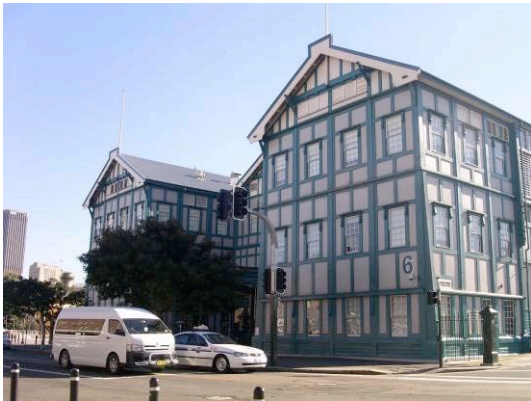
Fig 1. Finger Wharf at Woolloomooloo, Sydney

Designing buildings for increased live loads can lead to greater flexibility in usage. It is common practice for multinational clients to specify live loads of 5 kPa for office space even though 2.5 or 3 kPa may be permissible. The reason stated by developers is that the increased load does not add greatly to the building cost and permits a range of uses. For medium rise buildings, the increased live load increases the structure cost by 8-10%.