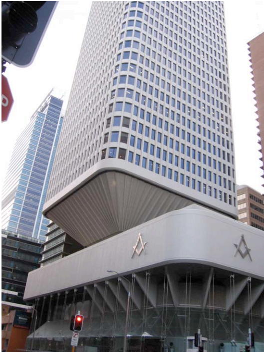
Fig 7. PTW's completed Sydney Civic Centre Tower

The factor which makes buildings adaptable and extendable is the attention paid during the original design and construction. It is the fact that foundations and lower structures are designed and constructed to accommodate the increased load of the final vision.