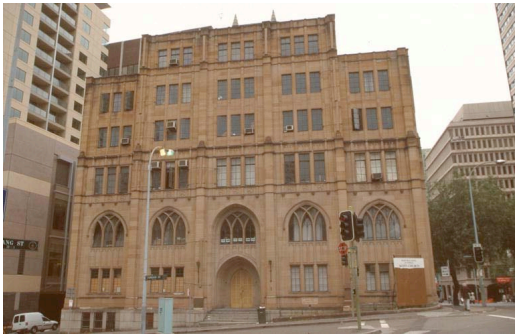
Fig 3. O. Beattie's Scots Church in 2000 [13]

architectural competition for the completion of the building. Tonkin Zulaikha Greer's winning entry added a contrasting modern cap to the original structure. By employing lighter structural materials than the original design, engineers, Van Der Meer, were able to add more floors than the original design. The extension also had to incorporate new regulations relating to sunlight to the nearby open space at Wynyard Park. This was achieved by stepping the roof line at an angle of 45 degrees.