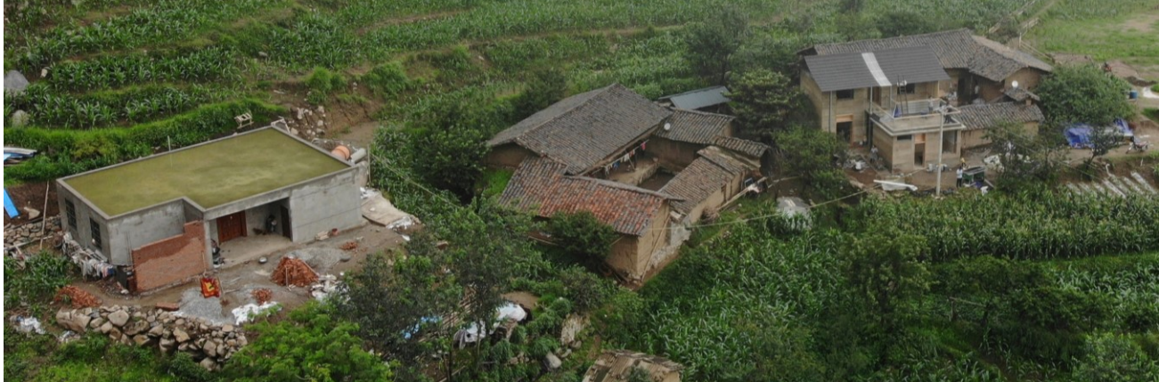
Picture 4: Interiors of brick-concrete house (left), traditional rammed earth house (middle) and new type house (right)